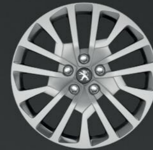
17 inch 'Miami' wheel trims