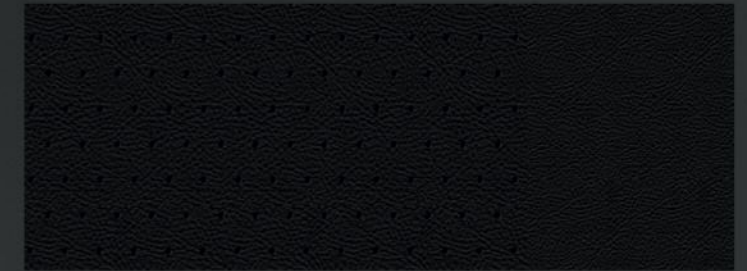
Black "Claudia" leather*, on Allure Level