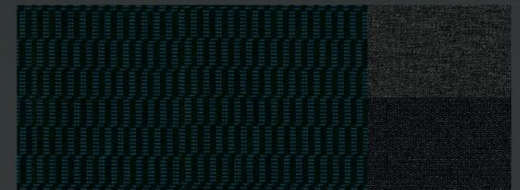
Grey and dark blue "Ocean" cloth trim, on Active Level