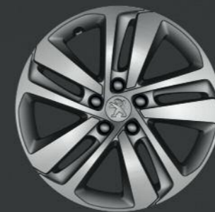
17 inch 'Phoenix' alloy wheels